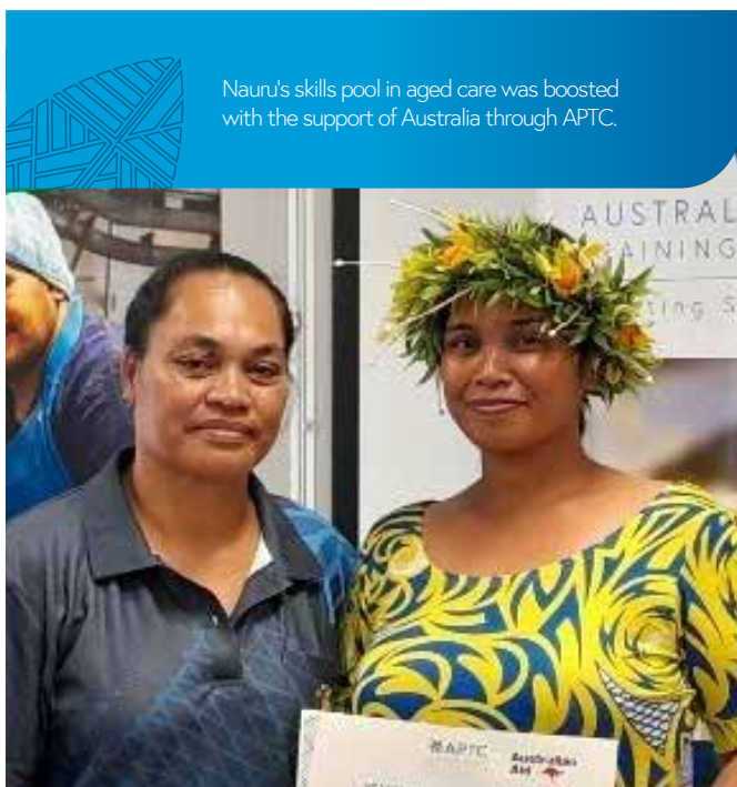
Nauru's skills pool in aged care was boosted with the support of Australia through APTC.